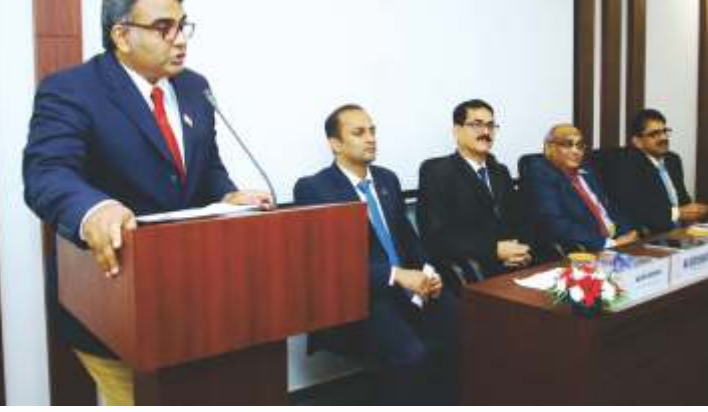
IPA of ICMAI Programme in Kochi, 16th September 2019