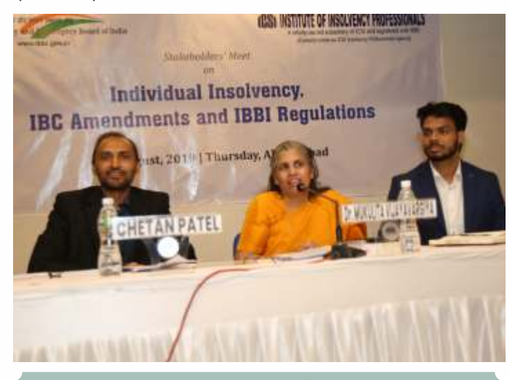
Roundtable in Ahmedabad, 8<sup>th</sup> August 2019

The details of workshops and roundtables, organised by IBBI during the quarter, are presented in Table 35.