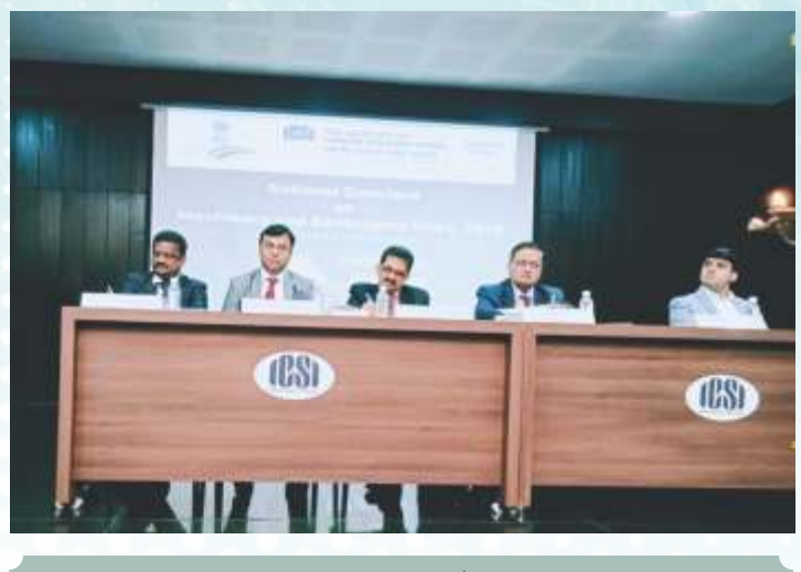
ICSI Conclave in Bangalore, 28th September 2019