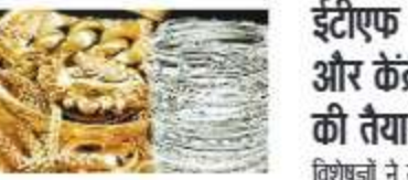
सोना पिछले सप्ताह 2.7 प्रतिशत बढ़कर 143590 रुपये प्रति 10 ग्राम तक पहुंच गया। यह वृद्धि आंशिक रूप से डॉलर के मुकाबले कमजोर रुपये और इंगन की जियोपॉलिटिकल स्थिति से प्रेरित थी।

सोने और चांदी की कीमतों में तेजी जारी है। वित्तवर्षों का मानना है कि आने वाले सप्ताह में सोने की कीमतों ऊपर की ओर बढ़ सकती है, जबकि चांदी में कुछ समेकन देखने को मिल सकता है।