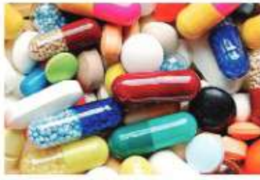
इंटेस्टाइनल व डर्मेटोलॉजी में 8 प्रतिशत की वृद्धि रही। कंपनी स्तर पर नुवामा सिस्कोयटीज

चालू वित्त वर्ष की तीसरी तिमाही में भारतीय दवा कंपनियों की आमदनी में घरेलू बिक्री के दम पर 8-11 प्रतिशत तक वृद्धि होने की उम्मीद है।