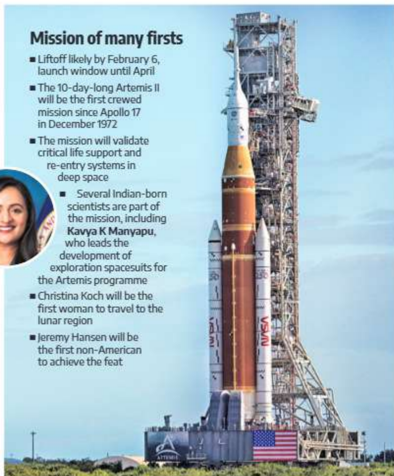
The Space Launch System rocket with the Orion crew capsule rolls towards launch complex at Kennedy Space Center in Cape Canaveral, Florida

flight engineer aboard the ISS for Expedition 41 from May through November of 2014. Glover, assigned to be the pilot of the mission, is a former US Navy pilot who was selected as an astronaut in 2013.