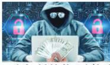
अगर किसी खाते में ऐसे छोट्टे फ्रॉड के पैसे फंसे हैं और कोई कोर्ट या बहाली का आदेश नहीं है, तो बैंकों को 90 दिनों के अंदर उस पैसे पर लगी रोक हटानी होगी।

साइबर फ्रॉड मामले में पैसा वापस पाने के लिए लंबा इंतजार नहीं करना होगा। गृह मंत्रालय ने एक नया नियम बनाया है।