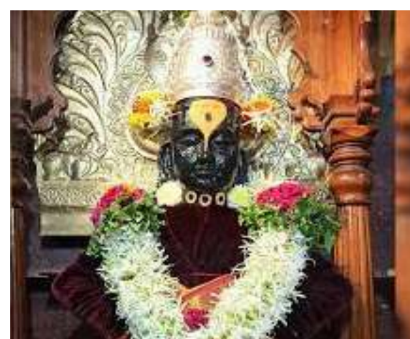
In this stone pot God Vitthal ate takpith (butter milk with jowar flour).

frees them from all their sins and takes them to Vaikuntha Loka. The temple is open from morning to evening.