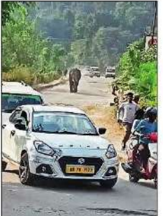
The elephant had strayed from Lohagarh forest of Kurseong forest division's Panighata