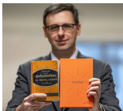
global Indological research.