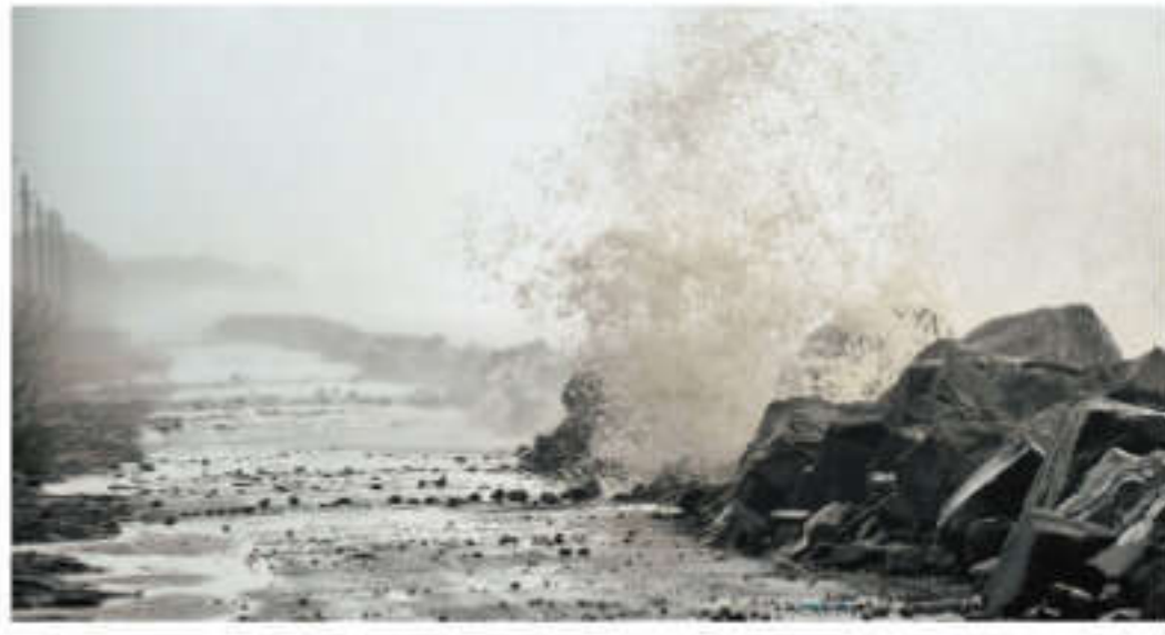
As Cyclone Montha makes landfall in Andhra Pradesh, high tides cover the road leading to Uppada village in Kakinada district on Tuesday

Chief Minister N Chandrababu Naidu held a high-level review at the Real-Time Governance System (RTGS) Command Centre in Amaravati on Tuesday to assess the impending impact of severe cyclonic storm