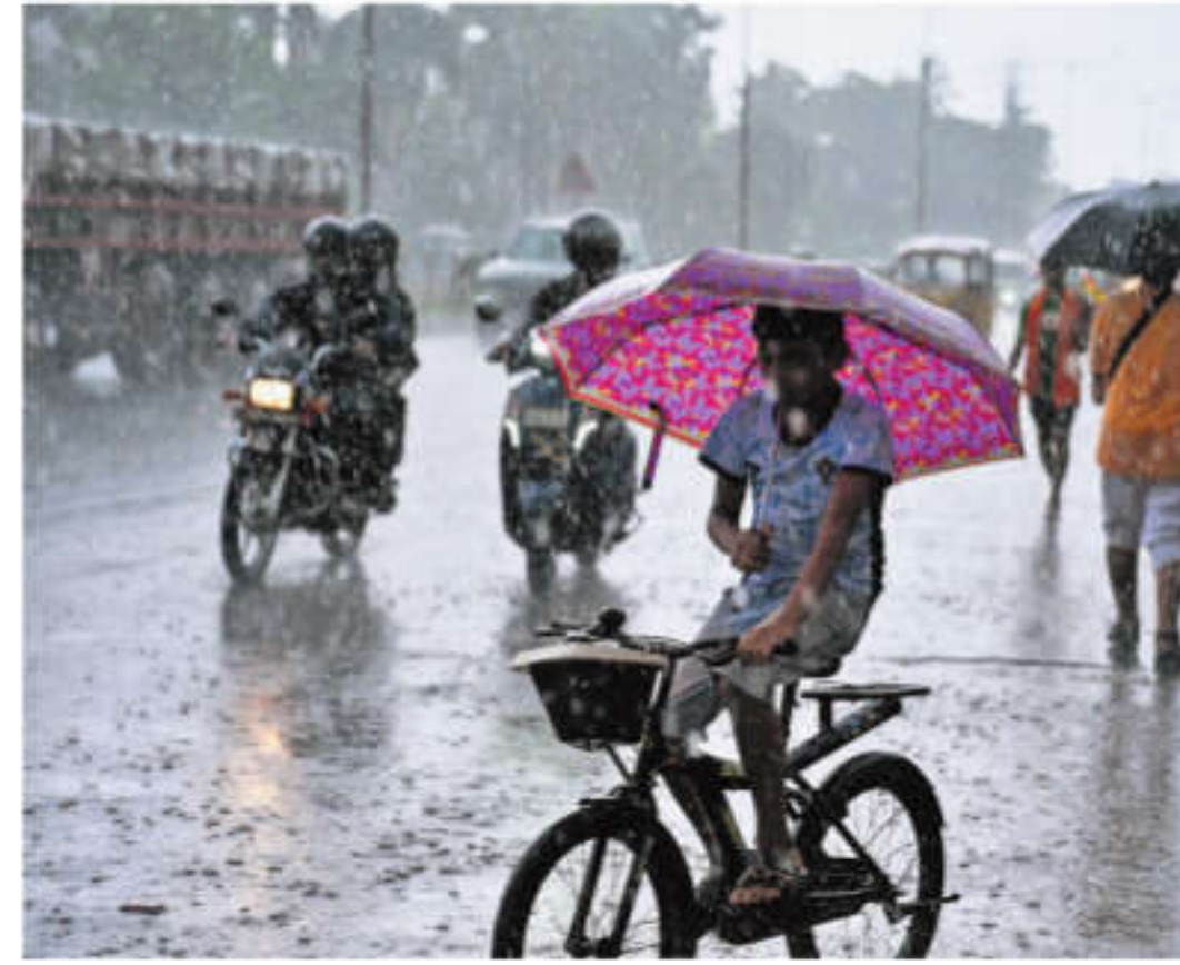
CAUGHT IN THE STORM

The ED has also raised questions on how private persons got access to confidential information pertaining to the government exam and the selection process.