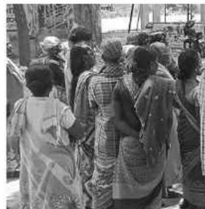
துறைமுக மாவட்டம் புனர்வாழ்வு இயக்கம் மூலம் மேலாண்மை அமைப்பில் தயார் நிலையில் வைக்கப்பட்டிருக்கிற மழை நிவாரண முகாம்களைப் பார்வையிட்டனர்.