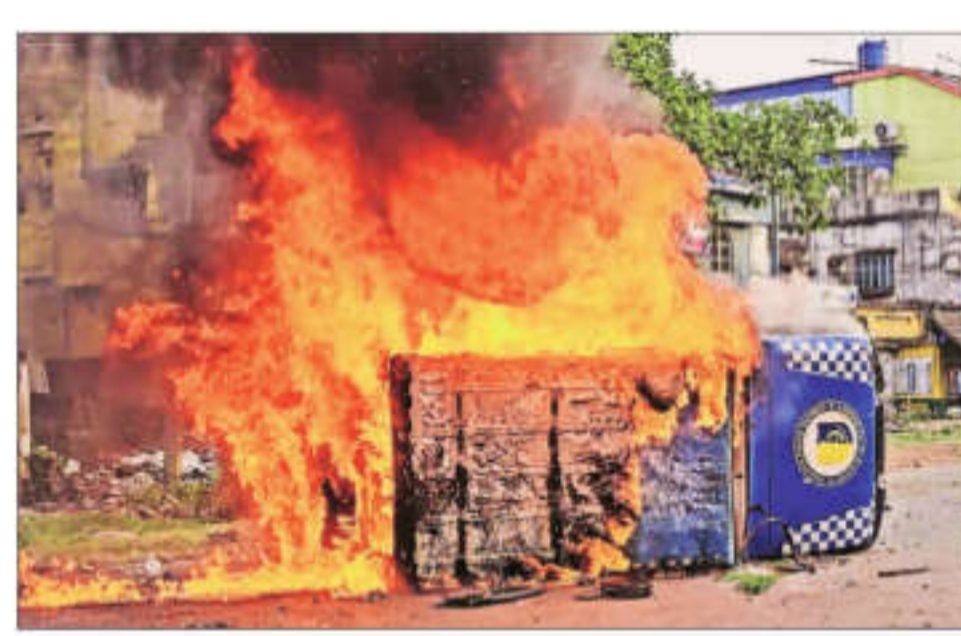
Police vehicles set on fire allegedly by members of the Indian Secular Front (ISF) during a protest march to Kolkata over Waqf (Amendment) Act, at Bhargar in South 24 Parganas district in West Bengal on Monday

PRESS TRUST OF INDIA Kolkata/Murshidabad/Malda, April 14