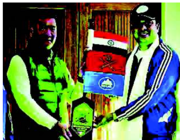
at Dhubri-Hatsingimari in Assam on February 14.

The expedition, undertaken by the Dirang-based National Institute of Mountaineering and Adventure Sports (NIMAS), will commence from Gelling (Upper Siang) on January 14 and conclude