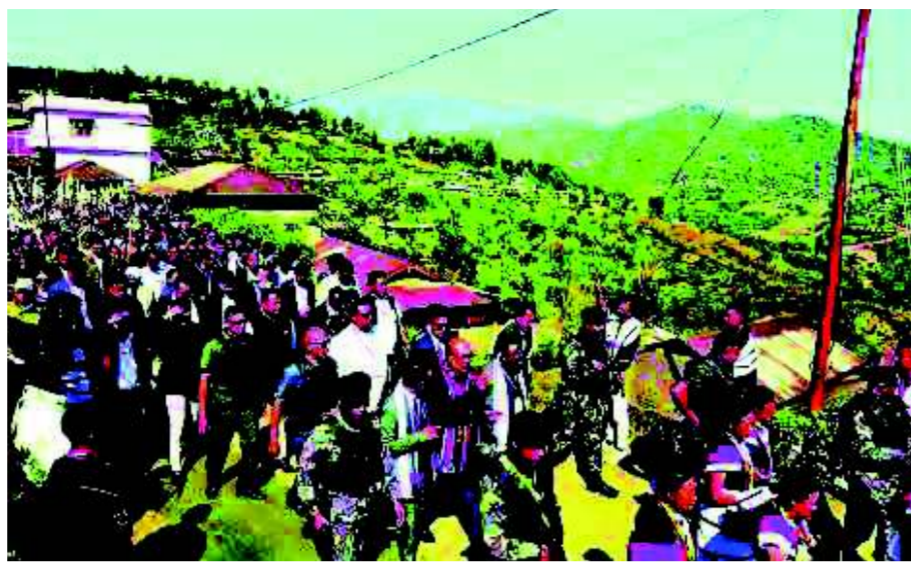
Manipur Chief Minister N Biren Singh arriving to attend a conference at Maram in Senapati district on Saturday.

“Whatever happened has happened. As I said during my New Year’s message, it is time to forget and forgive. We need to jointly walk on