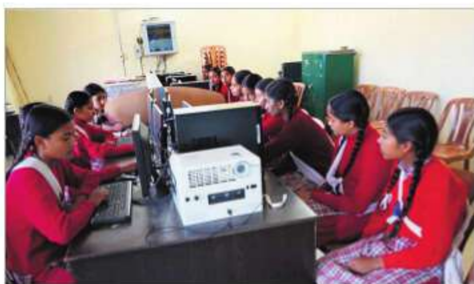
THE CLIMB OF A HILL STATE

Performance Grading Index 2024-25 rankings see state leap from 21st to sixth spot in just 2 years