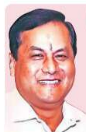
SARBANANDA SONOWAL, MINISTER OF PORTS, SHIPPING & WATERWAYS

The two initiatives — the Shipbuilding Financial Assistance Scheme (SBFAS) and the Shipbuilding Development Scheme (SBDS) — are aimed at strengthening the country's domestic shipbuilding capacity and improving global competitiveness, according to an official statement. Under SBFAS, which has a corpus of ₹24,736 crore, the government will provide financial assistance of 15-25% per vessel, depending on the vessel category. The SBDS, with a budgetary outlay of ₹19,989 crore, focuses on long-term capacity and capability creation.