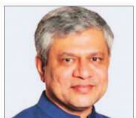
Union Railway Minister Ashwini Vaishnaw

travel growth through additional platforms, stabling lines, new terminals, maintenance facilities and multi-tracking, stated the press release.