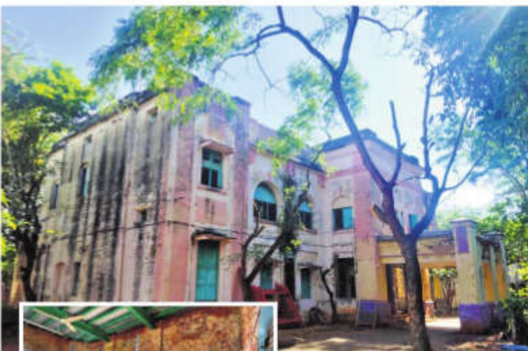
Langa and Takkoya blocks, originally built for training plantation workers, were used as the first classrooms for Thanthai Periyar govt college | EXPRESS