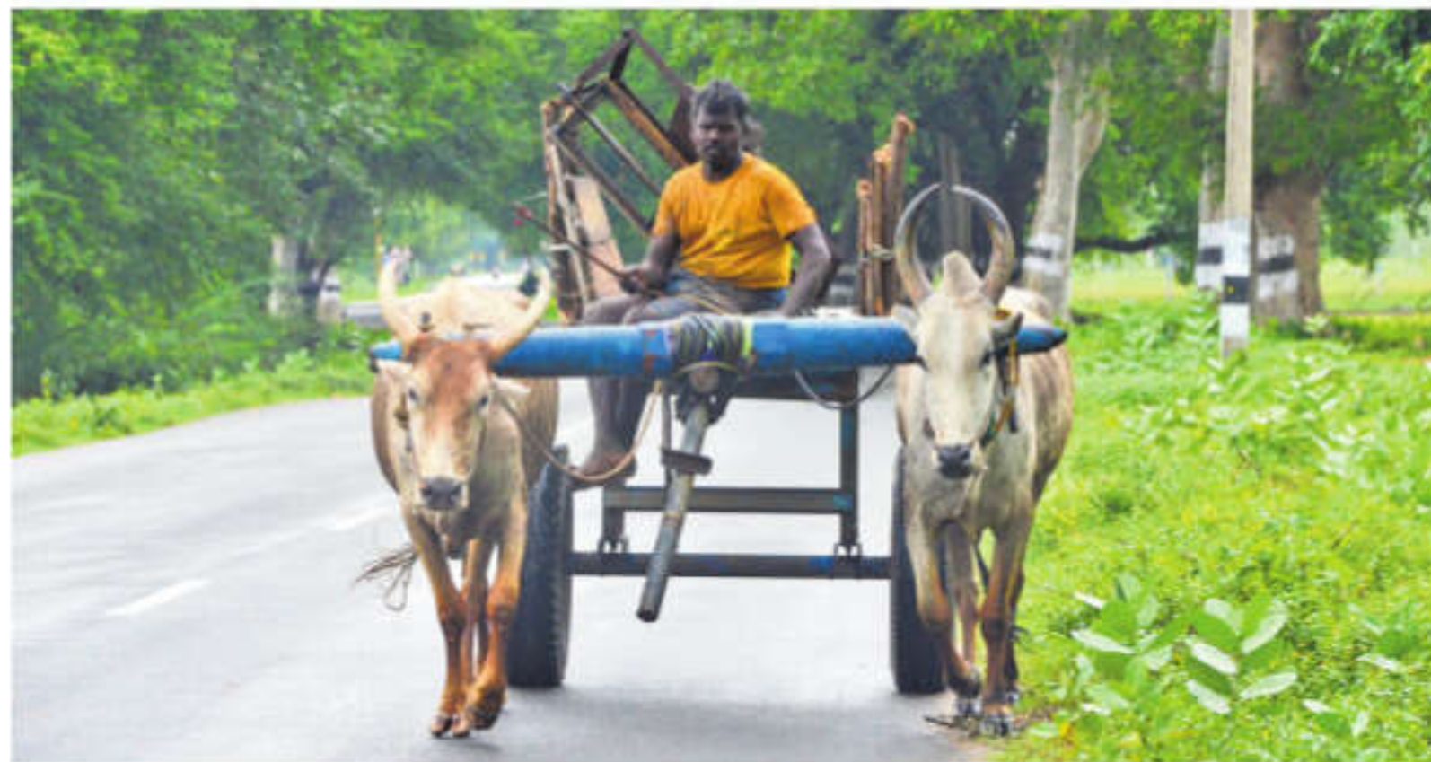
HARD DAY'S WORK At Mukkudal in Tirunelveli, a farmer rides his bullock cart along the tree-lined road after finishing a day of work in the fields, reflecting the region's continued reliance on traditional farming practices

As a long-term solution to the issue, the GCC has begun to construct 17 modern cattle sheds across 15 zones in the city. Currently, sheds at Tiruvottiyur, Madhavaram, Royapuram and Teynampet are functional. These sheds will remain a designated space for owners to leave their cattle instead of allowing them to roam the streets. This will ensure cattle owners' livelihood while addressing safety concerns, the release added.