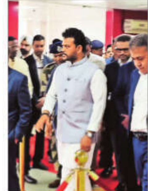
Civil Aviation Minister K Rammoan Naidu at the inauguration of the refurbished Terminal 2 of Delhi airport, on Saturday

are some things that we are working on, where the passenger, even if he is coming from another point and wanting to travel outside the country, can come to the hub destination, and without doing another immigration, can travel from there. "This is the D to I (Domestic to International) travel, and there is I to I (International to International) travel also," the minister said.