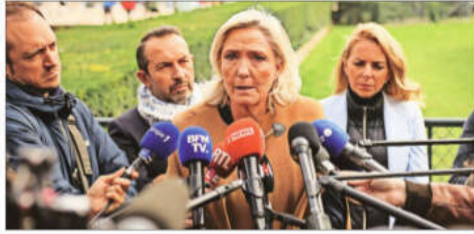
French leader Marine Le Pen answers reporters after visiting an exhibit at the Louvre museum in Paris

The transfer of some precious items from the museum's Apollo gallery, home to the French crown jewels, was carried out on Friday under secret police escort, RTL said, citing