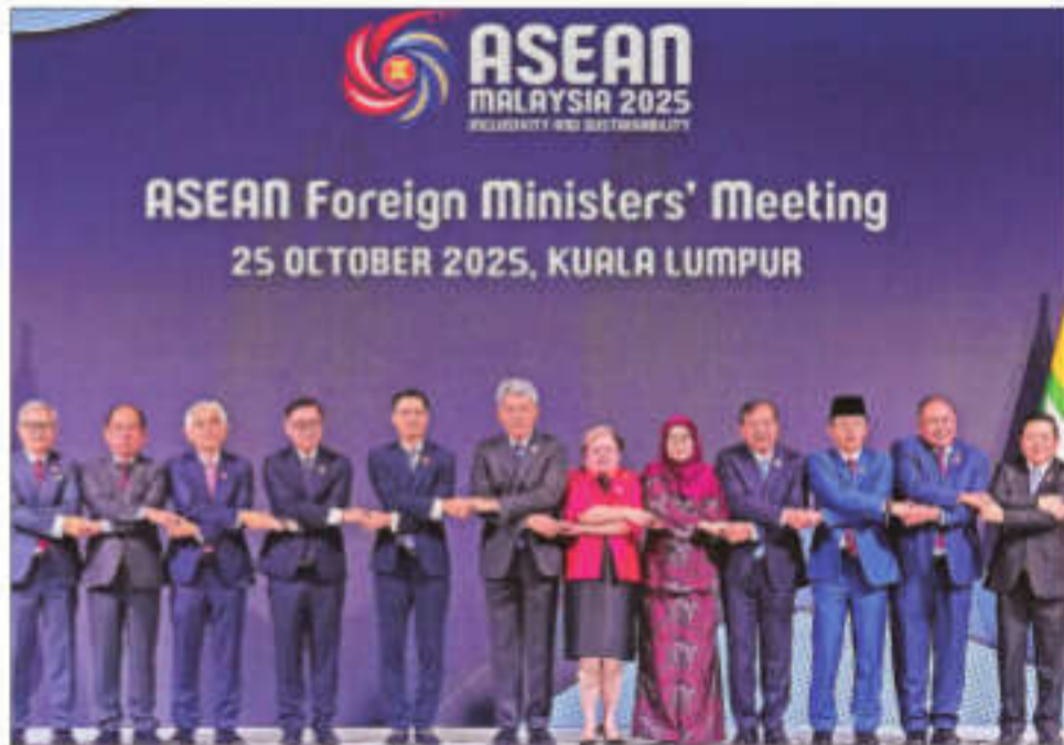
ASEAN leaders to focus on regional security, economic resilience, and maritime disputes over discussions

Leaders are expected to focus on regional security, economic resilience, and maritime disputes — with US tariffs and shifting global trade patterns looming large over discussions. Malaysian