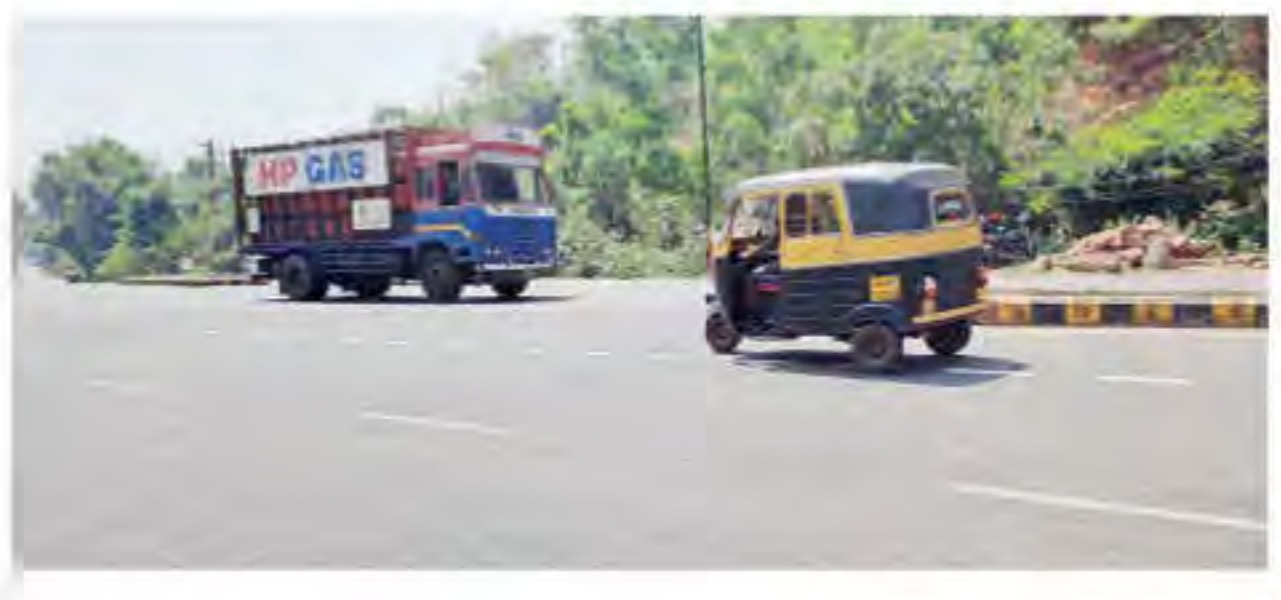
चाररस्तो महामार्गा वयलें घातक जंक्शन.

भांगरभूंय । प्रतिनिधी काणकोण : चाररस्तो खाट्यार वाठारांत वीज उपकेंद्रा लागसारच्या मनोहर परीकार राष्ट्रीय महामार्गा वयलें जंक्शन येरादारी खातीर घातक जालां. आतां मेरेन थंय कितलेशेच किरकोळ अपघात जाल्यात. फुडारांत थंय व्हड अपघात जावपाची शक्यताय आसा. राष्ट्रीय महामार्ग अधिकार्यांनी हाचेर लक्ष घालून फुडारांतले गंभीर गजालींचेर उपाय काडचो, अशी वाहन चालकांची मागणी आसा. चाररस्तो खाट्या वयल्या जंक्शना वयल्यान मडगांव सावन येवपी गाडयांक थेट कारवार वचपाची आनी कारवार सावन येवपी गाडयांक मडगांवां वचपाची वेवस्था आसा. ह्या जंक्शना वयल्यान ओल्लत मारून श्री मल्लिकार्जुन विद्यालया कडल्यान पाळोळें, पाटणें वाठारांत वचपाचीय वेवस्था आसा. मात ह्या जंक्शना वयल्यान पाळोळें, पाटणें वचपाक ओल्लत मारतना आनी त्याच वेळार