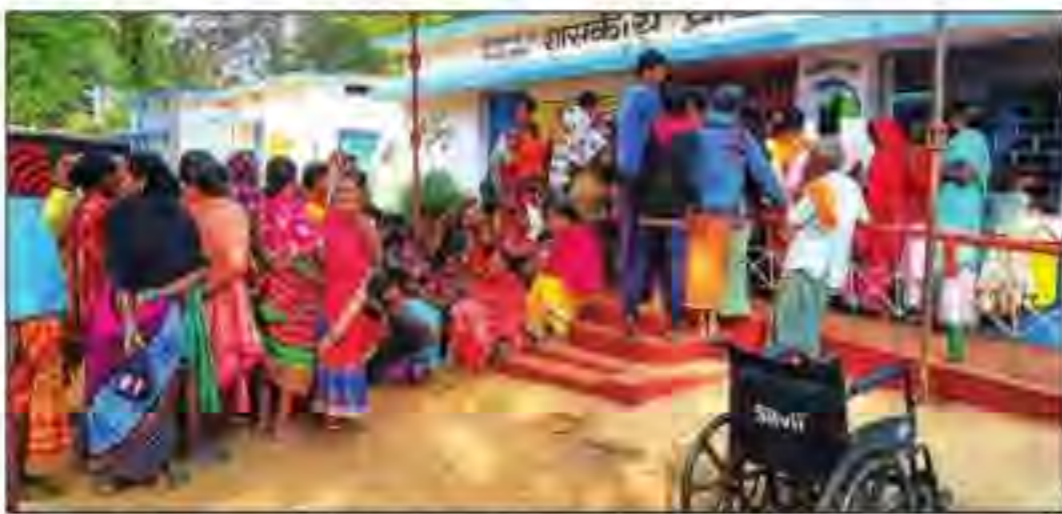
Women wait to cast their votes for the Chhattisgarh local election

Raipur: Voting for first phase of panchayat elections got underway in Chhattisgarh on Monday, with nearly 76% voters casting their ballot. Chief minister Vishnu Deo Sai said this was the first time that Maoists haven't dared oppose rural elections in the state.