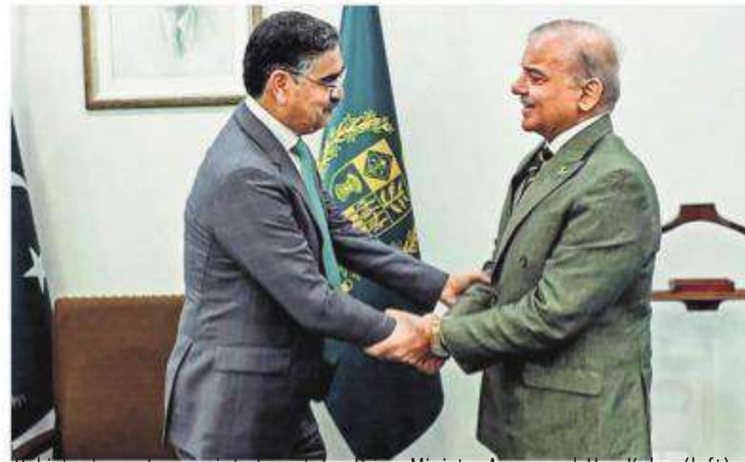
Pakistan's newly-appointed caretaker Prime Minister Anwar-ul-Haq Kakar (left) shakes hands with outgoing Prime Minister Shehbaz Sharif on Monday

Kakar, an ethnic Pushtun from the Balochistan province, was unanimously chosen as interim premier to oversee the