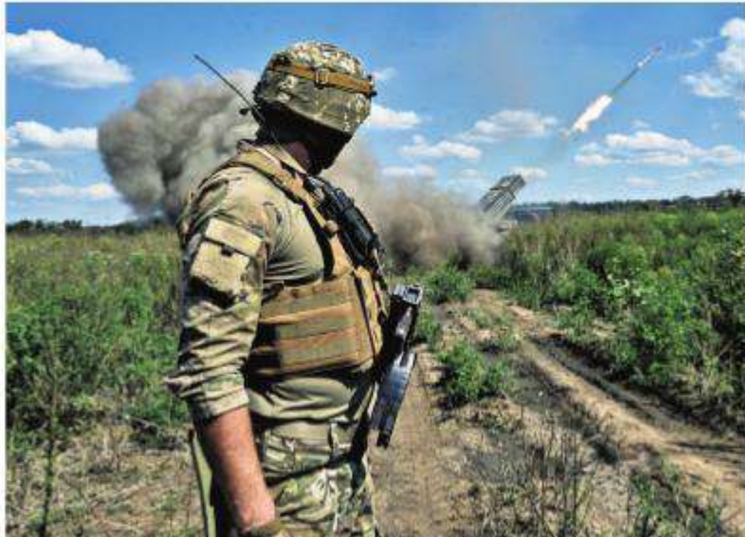
An Ukrainian soldier watches as a 'Grad' multiple-launch rocket system fires shells near Bakhmut on Monday

"In the Bakhmut sector, three square kilometres were liberated last week," Deputy Defence Minister Ganna Malyar told state television, adding