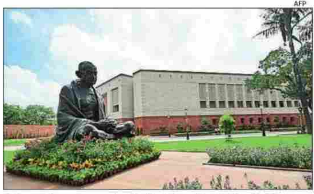
BJP's reaction comes against the backdrop of opposition INDIA bloc accusing govt of presenting a "discriminatory" budget

Party's reaction comes against the backdrop of Congress and other constituents of the opposition INDIA bloc accusing govt of presenting a "discriminatory" budget towards opposition-ruled states after finance minister Nirmala Sitharaman made a host of budgetary announcements for Andhra Pradesh