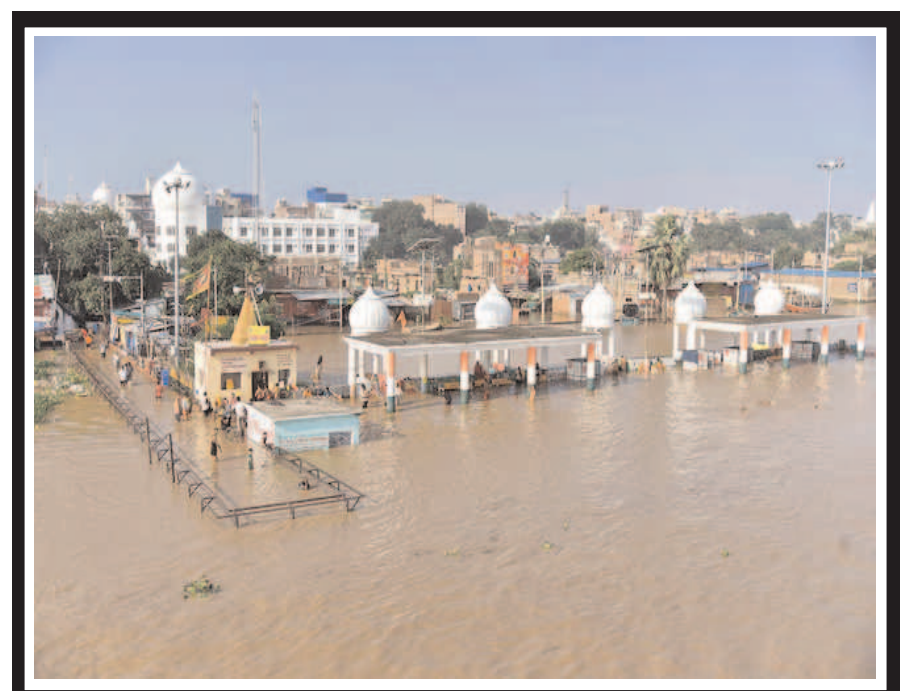
A view of the Kangan Ghat submerged in flooded water of the Ganga river, in Patna.

body's finances. The Standing Committee is the financial backbone of the MCD as no proposal over Rs 5 crore can be passed without its approval. If the AAP manages to secure the vacant seat then it will lead to a tie, and a draw-of-lots will have to be held to elect the Committee's chairperson. However, if the BJP wins then it will lead to a situation that has never been seen before, where the Opposition has control over MCD's financial matters.