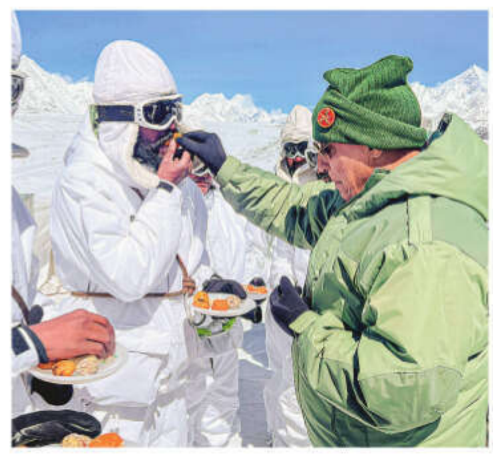
Defence Minister Rajnath Singh during a visit to Siachen Base Camp in Ladakh on Monday.

described the operation, which was launched by the Indian Army in Siachen on April 13, 1984, as a golden chapter of the country's military history. "The success of Operation Meghdoot is a matter of pride for all of us," he said.