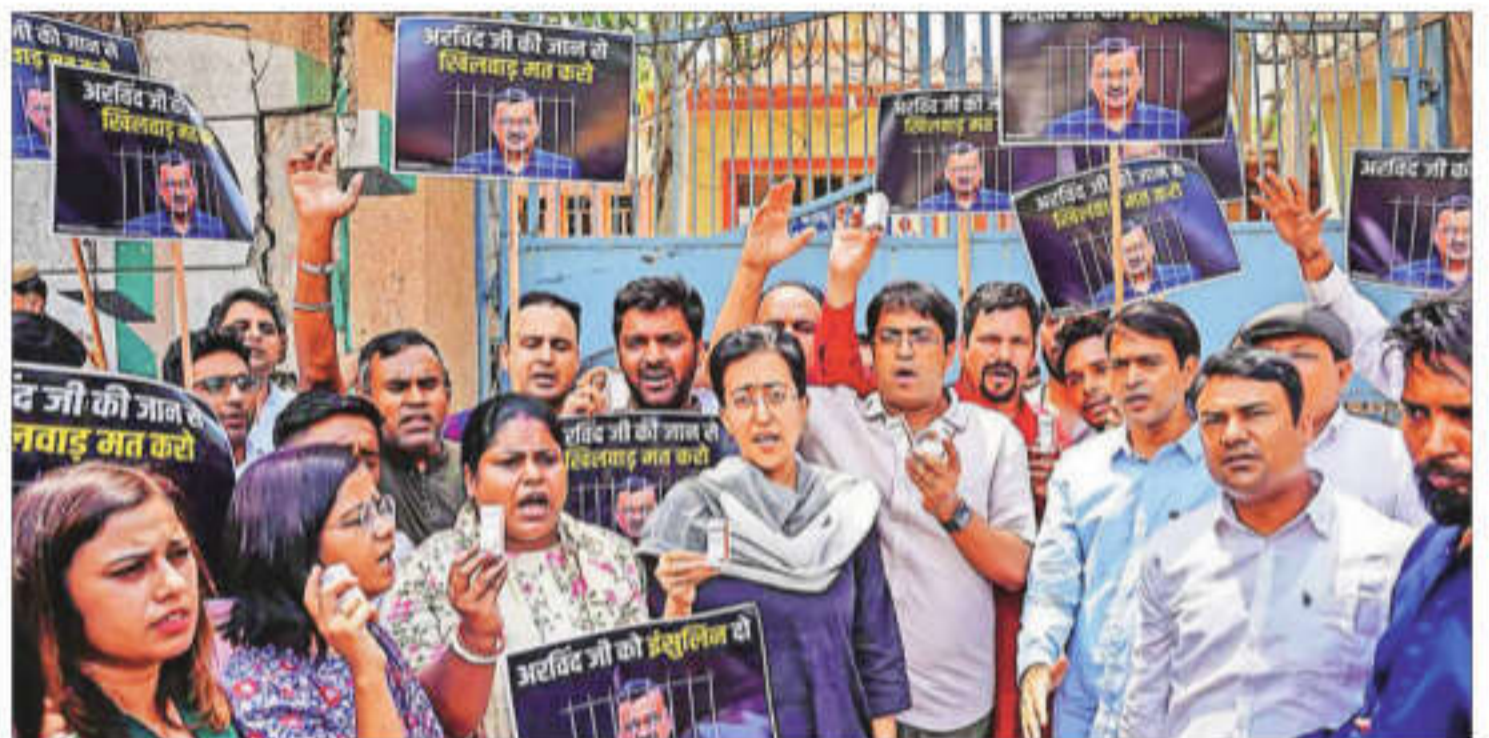
Delhi minister Atishi along with AAP supporters with vials of 'insulin' during a rally outside the Tihar jail on Sunday