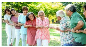
GROWTH POTENTIAL. Developers are targeting India's growing senior population with specialised housing projects, anticipating a $12-15 billion market by 2030

The north — including Haryana, Rajasthan, Uttarakhand, and parts of Uttar Pradesh — accounts for 25 per cent, while Maharashtra and Gujarat contribute the remaining 13 per cent, according to CBRE Chairman Anshuman Magazine.