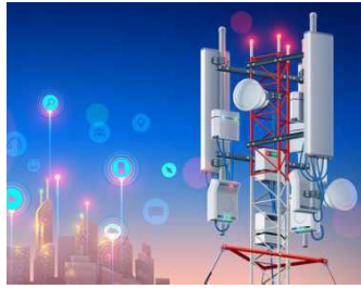
INFRA CLASH. Earlier, the companies had also opposed a third-party agreement between the Mumbai Metro Rail Corporation Ltd and ACES for IBS deployment

In various joint letters addressed to the authorities of Navi Mumbai, Guwahati, Thiruvananthapuram and Bengaluru airports (whose IBS licenses will expire on May 31), the telcos noted that "unlicensed entities holding IP-1 (infrastructure provider-1) registrations from the Department of Telecommunication" had approached the airport officials to deploy the IBS.