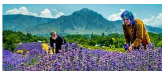
PURPLE YIELD. More than 2,500 farmers cultivate lavender across J&K, with Bhatdwarah emerging as a major centre

The oil extracted from its flowers is widely used in the production of soaps, perfumes and medicinal products. According to Wani, over 1,000 farmers in the Valley have already shifted to lavender farming in recent years. Official data suggest that more than 2,500 farmers cultivate lavender across Jammu and Kashmir, covering around 2,500 acres.