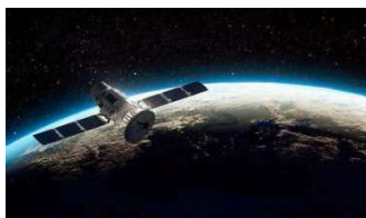
WELCOME EXPERTISE. Vellon Space is building the technology needed to undertake bio-pharma and other research in unmanned space laboratories

In the long term, Helogen envisions becoming an instrumentation and science mission partner for ISRO to help in space agency having its ambitious plans of Bharatiya Antariksha Station, targeted for launch around