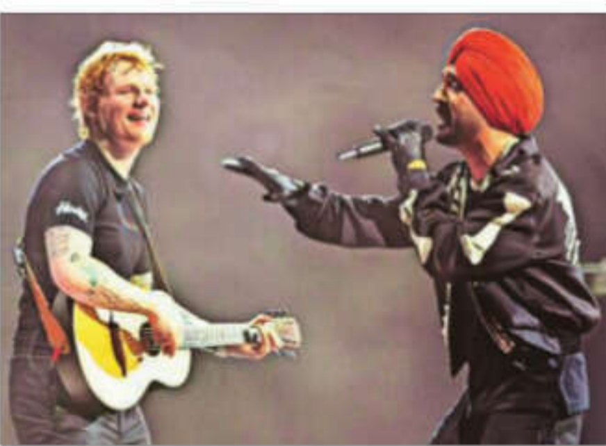
Ed Sheeran, seen with Diljit Dosanjh, had a sold-out concert in Mumbai in March. Sheeran is set to return to India in 2025

GIVEN THE EVOLVING GLOBAL dynamics, India is the new kid on the block which is opening to the world of 'experience economy'. A host of music concerts have been announced with some global artistes like Maroon 5, Green Day, Shawn Mendes, Louis Tomlinson coming for the very first time. Other artistes like Coldplay, Dua Lipa, Ed Sheeran are playing once again in India. This frenzy has also pushed local performers like Diljit Dosanjh to the forefront. The rise in disposable income has resulted in the significant demand surge for such concerts in India. The direct and indirect spending on these concerts spanning around two-three months will provide a major boost to the overall spending and consumption