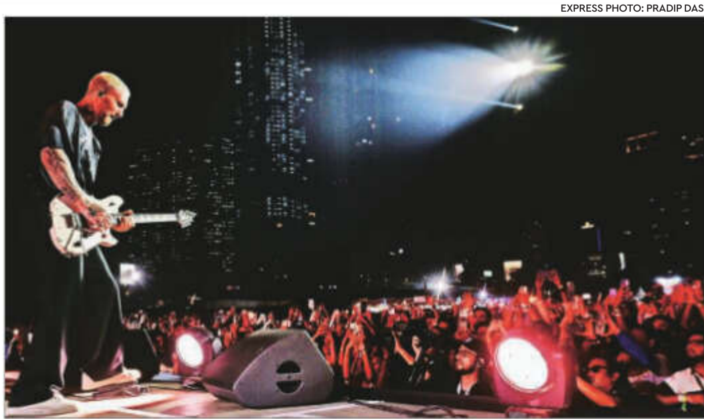
Maroon 5's Adam Levine seen at the band's debut India performance in Mumbai on Tuesday