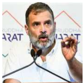
Congress leader Rahul Gandhi ANI

The Congress and Rahul Gandhi are under attack by Prime Minister Narendra Modi who had said that if one has two houses, including a small flat for children in a nearby city, the Congress will ask such people to return one to the government. "If anything is kept even inside the Bajra box of your house, it will also be searched. If it is kept in the wall, it will be searched using X-Ray," Modi said in his own style and added that whatever extra property than necessity people have, the