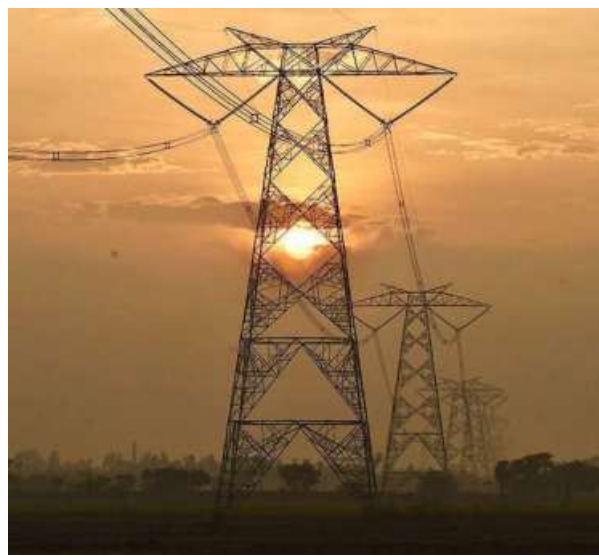
SPIKE IN DEMAND. The exercise assumes significance as India enters peak electricity demand season — April to June — with demand expected to hit 260 GW from 240 GW in September last year

Pointing out the Tariff Policy 2016, the Ministry said that power stations are