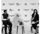
CM Devendra Fadnis at the 'India-Middle East-Europe Economic Corridor (IMEC) Summit 2025', on Monday

The State is in the process of creating a third Mumbai and the Navi Mumbai Port and the new airport. And this will be three times the existing Mumbai.