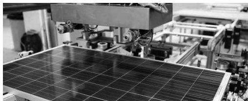
CAPACITY EXPANSION. By February-March 2027, the company will be manufacturing about 10 GW of downstream (Ingot to wafer to cell to module) capacity

The solar photovoltaic (PV) manufacturing subsidiary of Andhra Pradesh-based Shirdi Sai Electricals (SSEL) Group is setting up a vertically integrated giga-scale solar photovoltaic (PV) manufacturing facility — from quartz to module — at Ramapattanam under the production linked incentive (PLI) scheme. "By December, we will be