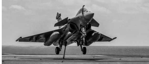
AERIAL DEFENCE. The deal follows the approval given by the Cabinet Committee on Security, headed by Prime Minister Narendra Modi earlier this month. SHARAD MATHUR

The deal follows the approval given by the Cabinet Committee on Security (CCS), headed by Prime Minister Narendra Modi earlier this month.