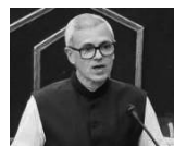
Jammu and Kashmir CM Omar Abdullah speaks in the Assembly.

Amidst an emotional debate in the Jammu and Kashmir Assembly, Chief Minister Omar Abdullah on Monday candidly said that he would not resort to petty politics by using the Pahalgam terror attack to demand Statehood from the Centre.