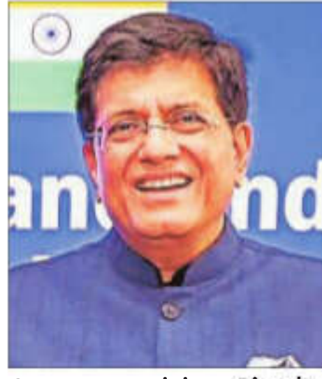
Commerce minister Piyush Goyal said AI industry should take lessons from the IT services industry

Until 1999, many computer programmes used only two digits to represent the year (such as "99" for 1999). At the turn of the 21st century, computers would misinterpret "00" as the year 1900 which would have caused miscalcula-