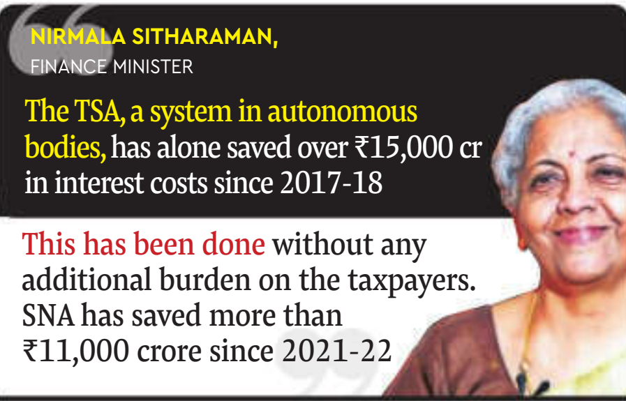
NIRMALA SITHARAMAN, FINANCE MINISTER

With the implementation of the Central Nodal Agency (CNA) for central sector schemes, SNA for centrally-sponsored schemes and TSA for autonomous bodies, the Centre is now able to track funds flow till the end-user. With all these payment systems linked to the overarching Public Financial Management System (PFMS), the Centre analyses the real-time funds available in schemes and next installment can't be booked until the previous