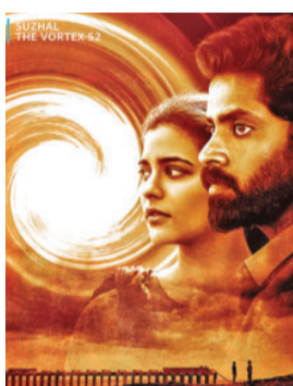
Citadel: Honey Bunny and new season of Suzhal-The Vortex will soon be up for streaming on Amazon Prime