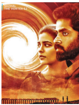
Citadel: Honey Bunny and new season of Suzhal-The Vortex will soon be up for streaming on Amazon Prime