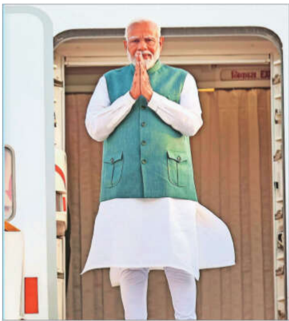
Prime Minister Narendra Modi leaves to attend the 50th G7 leaders summit in Italy

Last Sunday, nine pilgrims were killed and 33 injured when a bus carrying pilgrims was attacked in Reasi.