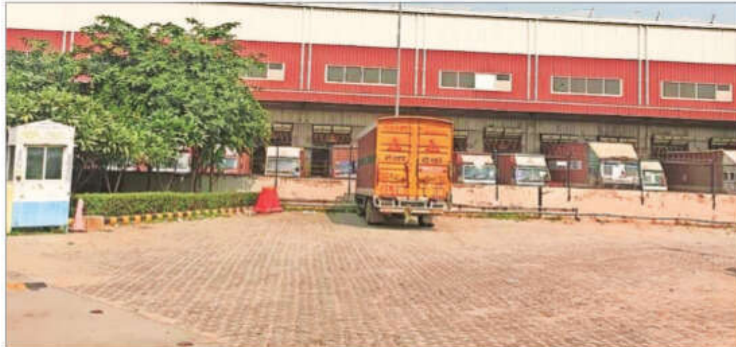
The Amazon warehouse in Manesar near Delhi.

The Act also fixes intervals for rest: "...no worker shall work for more than five hours before he has had an interval for rest of