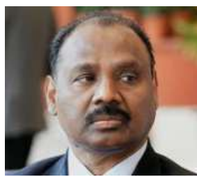
Girish Chandra Murmu, CAG

New Delhi is hosting the 16th ASOSAI assembly, which symbolises a renewed commitment to cooperation and capacity building among SAIs across Asia. Murmu highlighted this was the first in-person meeting of ASOSAI members after the