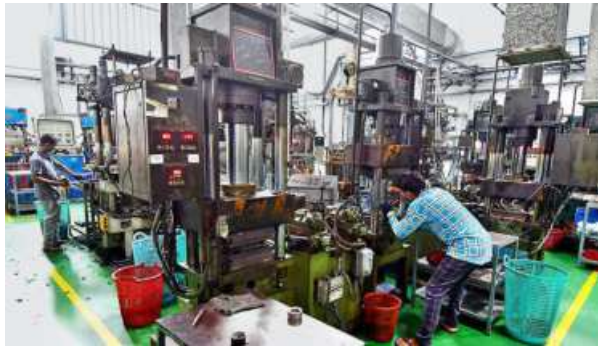
BUDGET PUSH. The initiatives proposed in the Budget are expected to give a fillip to the sector's sustainability and growth

DIGITALISATION DRIVE The increase, though considerably lower than the growth registered in FY23, came on the back of measures and a renewed focus on MSME