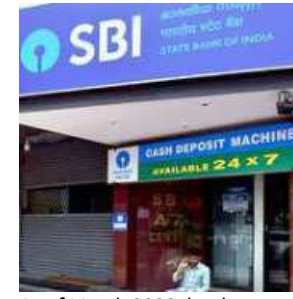
As of March 2023, lenders, including SBI, had an exposure of ₹2,391 crore to SIIL

They emphasised that the compromise settlement was agreed to by 86 per cent of the lenders by value of their exposure. Such settlements have to be approved by the National Company Law Tribunal and once it is approved by the Tribunal, it becomes binding on all the creditors/lenders. Some of the EPC (engineering, procurement and construction) cases which were resolved under CIRP, resulted in less than 5 per cent recovery for lenders.