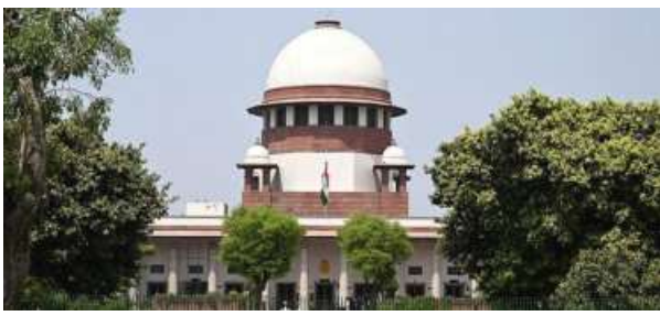
READING RIGHT. Judgement pointed to Article 300A simultaneously inserted into the Constitution which provided, "No person shall be deprived of his property save by authority of law."

The judgment noted that though the 44th Constitutional Amendment omitted the right to prop-