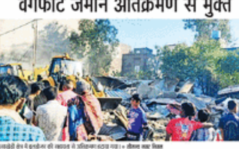
सुदुनिया अधिवान से इंदौर : डेली कालेज से मूसाखेड़ी तक 43 हजार वर्गफीट जमीन अतिक्रमण से मुक्त