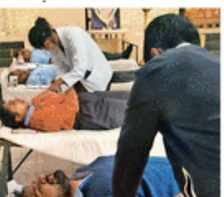
इंदौर : विशेष स्वास्थ्य जांच शिविर में सैकड़ों लोगों को मिला लाभ