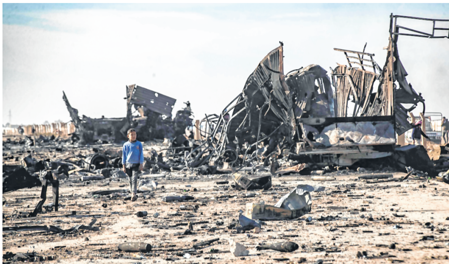
A military vehicle destroyed in overnight Israeli strikes

Israel launched intense air-strikes on Syrian army bases on Tuesday, aiming to prevent weapons from falling into hostile hands. Israeli officials denied reports that their forces advanced beyond the demilitarized buffer zone near the border, but security sources claimed otherwise. According to three security sources, Israeli forces had moved past the buffer zone. A Syrian source reported they had reached Qatana, a town several kilometers beyond the zone and about 25 km southwest of Damascus. Following their seizure of the buffer zone in southern Syria, Israel reportedly conducted extensive airstrikes against Syrian military and air bases overnight.