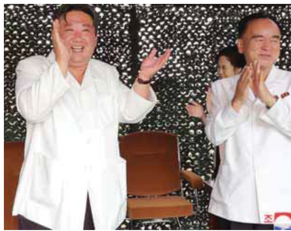
A TV screen shows an image of North Korea's missile launch during a news program at the Seoul Railway Station in Seoul, South Korea on Thursday.

According to KCNA, the missile was launched at a high angle to avoid neighbouring