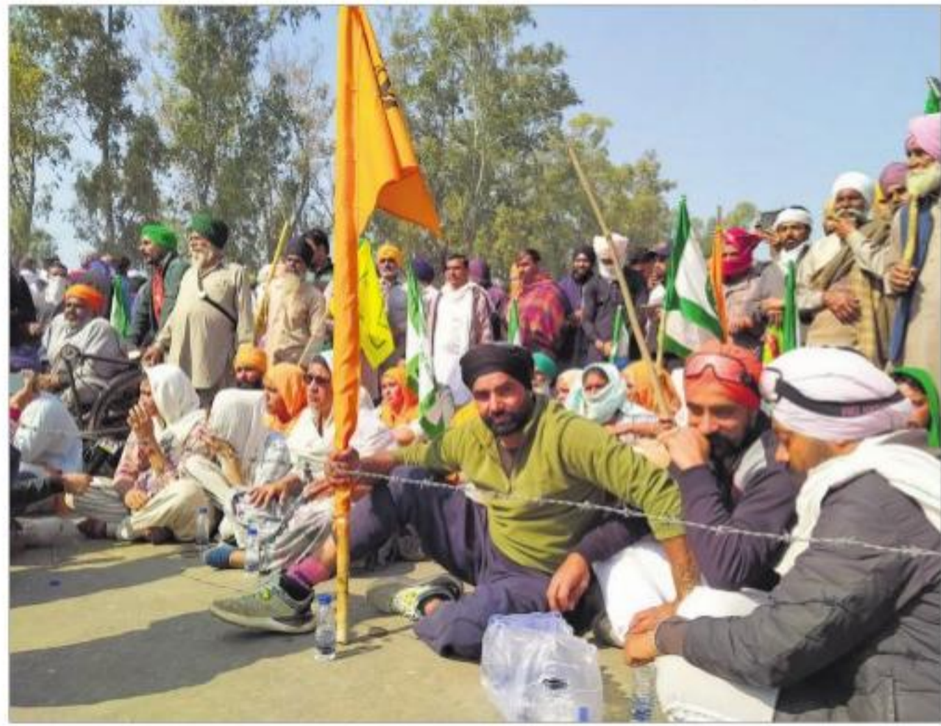
Protesting women activists at Data Singh Wala border in Jind on Thursday.

CHANDIGARH, FEBRUARY 15 Chief Minister Manohar Lal Khattar has said the Haryana security agencies had conveyed to their Punjab counterparts that the farmers would not be allowed to proceed to Delhi, but no effort was made to stop them from converging at the borders. Addressing a press conference after the launch of various initiatives, Khattar said this indicated that they had "political backing". He said there was a difference between "supporting farmers" and supporting the "movement of farmers". Saying that the farmers came in trailers carrying ration and earth-movers, "like an army on the move", he said the state had no problem in giving them passage to proceed to Delhi. "They could have gone by train or buses or as a delegation, but we can't allow them to travel in tractor-trailers. These cannot be a means of transport. We all saw what happened during the last agitation when the tractor-trailers choked the Capital," he said in response to a question about the farmers' protest at the state borders. Stating that protecting the interests of the state's population was the responsibility