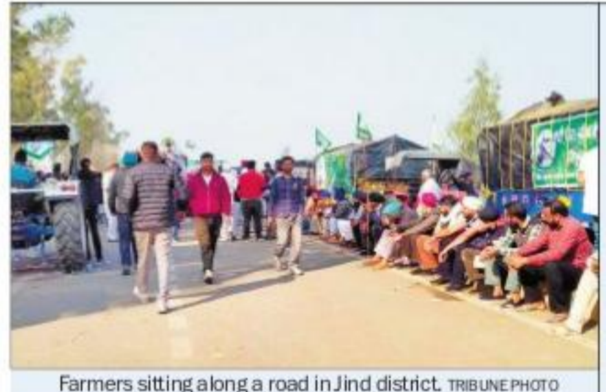
Farmers sitting along a road in Jind district.

Commuters travelling between Chandigarh and Delhi have been advised to use the Panchkula-Barwala-Babain-Ladwa-Karnal-Panipat-Sonepat-KMP route. Travellers between Delhi and Chandigarh can use the KamaHndi-Ladwa-Yamunanagar-Panchkula route.