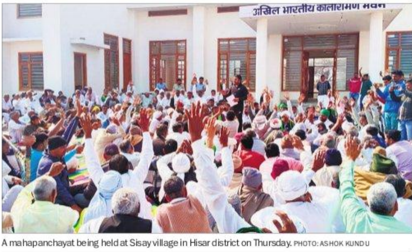
A mahapanchayat being held at Sisay village in Hisar district on Thursday.