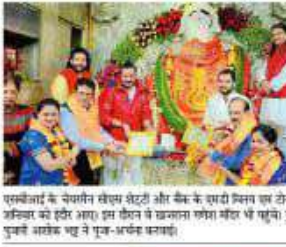
एकज्याड़े के चतुर्थी वसंत शंकरादी और शिव के पूजा दिवस पर ठोसो अर्चना कर रहे हैं। इस दौरान वे खजराना गणेश धारण भी करेंगे।

इंदौर में तीन दिनी महोत्सव का आयोजन किया जा रहा है। इस दौरान तिल-गुड़ के सवा लाख लड्डुओं का भोग होगा। तिल चतुर्थी मेला 17 से शुरू होगा। खजराना गणेश धारण करेंगे ढाई करोड़ के स्वर्ण आभूषण।