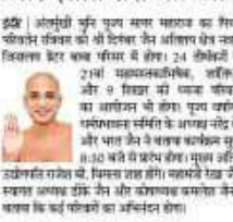
इंदौर | अंतर्मुखी मूर्त पूजा करत महाराज का 21वां महामस्तकाभिषेक और शांतिधारा का आयोजन आज होगा।