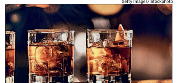
CAG said the recommendations of the expert committee, formed for suggesting changes for formation of new excise policy, were ignored

It dramatically surfaced in political circles on Saturday, leading BJP to launch a ferocious attack on AAP. Approached by TOI, sources in the govt confirmed its authenticity. The report talks about the pricing of liquor left at the discretion of the manufacturer and wholesalers instead of the govt, something which was the focus of CBI's investigation. "This discretion allowed LI licencee (manufacturer and wholesaler) to manipulate prices of liquor to its own advantage," CAG has said. This led to a decline in sales and loss to exchequer, the report says, adding that there was no monitoring of quality control either of the liquor sold in the capital.