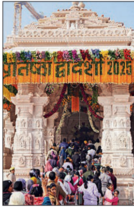
Ram temple construction offers lessons for future projects aiming to preserve heritage

Despite these precautions, minor surface cracks of 1mm appeared during the early stages of curing. Experts from IIT Madras, IIT Delhi, CBRI Roorkee, Larsen & Toubro and Tata Consulting Engineers, with guidance from Prof VSRaju and the temple trust construction committee, identified thermal strain as the primary cause. The initial large pour size (27m x 9m x