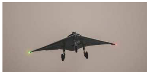
EUREKA! DRDO carried out a successful flight trial of the Autonomous Flying Wing Technology Demonstrator from the Aeronautical Test Range, Chitradurga, Karnataka.

"This was possible using onboard sensor data fusion