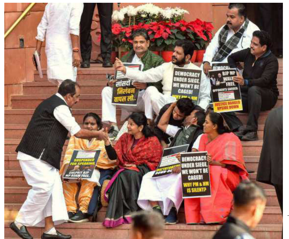
MAKING COMMON CAUSE. Opposition MPs, who were suspended for the remainder of the Winter Session, stage a protest at the Makara Dwar of the Parliament House, in New Delhi on Friday. A total of 14 MPs — 13 from Lok Sabha and 1 from Rajya Sabha — have been suspended.