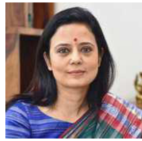
TMC MP Mahua Moitra

who voted for the panel is Preet Kaur, suspended Congress leader and wife of former Punjab Chief Minister Captain Amarinder Singh who has joined the BJP. The panel's draft report is said to have found Moitra's conduct "highly objectionable", "unethical", and "heinous".