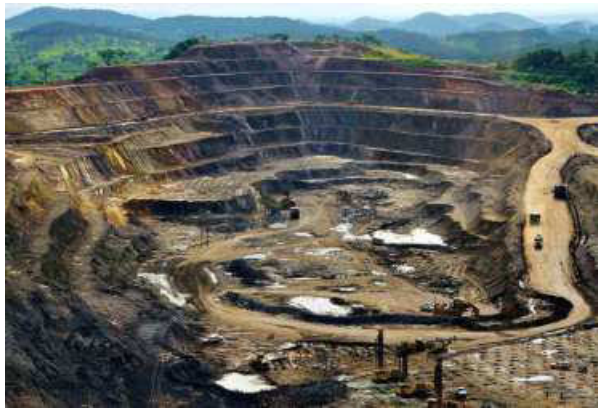
NEW APPROACH. The proposed policy changes are expected to encourage junior mining companies from around the world to take up exploration projects with NMET funding.

According to the official, besides stepping up the "pace of exploration" of critical minerals, the new approach