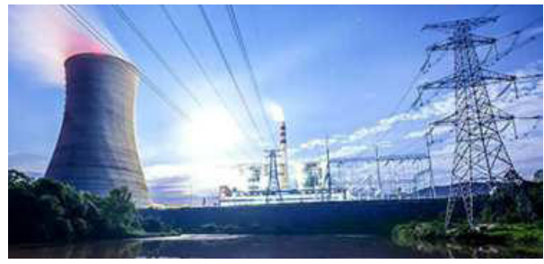
POWER-PACKED. Overall, 20 thermal projects of 27,180 MW are under construction across central, state and private sectors in India

In the thermal power category, 3440 MW worth of coal-fired projects are being implemented by the state energy utility Tangedco. These projects include Ennore SCTPP (2x660 MW), North Chennai TPP Stage-III (1 x 800 MW), and Udangudi STPP Stage 1 (2x660 MW). Overall, 20 thermal power projects with a total capacity of 27,180 MW across Central, State, and Private sectors are under construction in the country. With a total capacity of 7,260 MW, Uttar Pradesh accounts for a major portion of