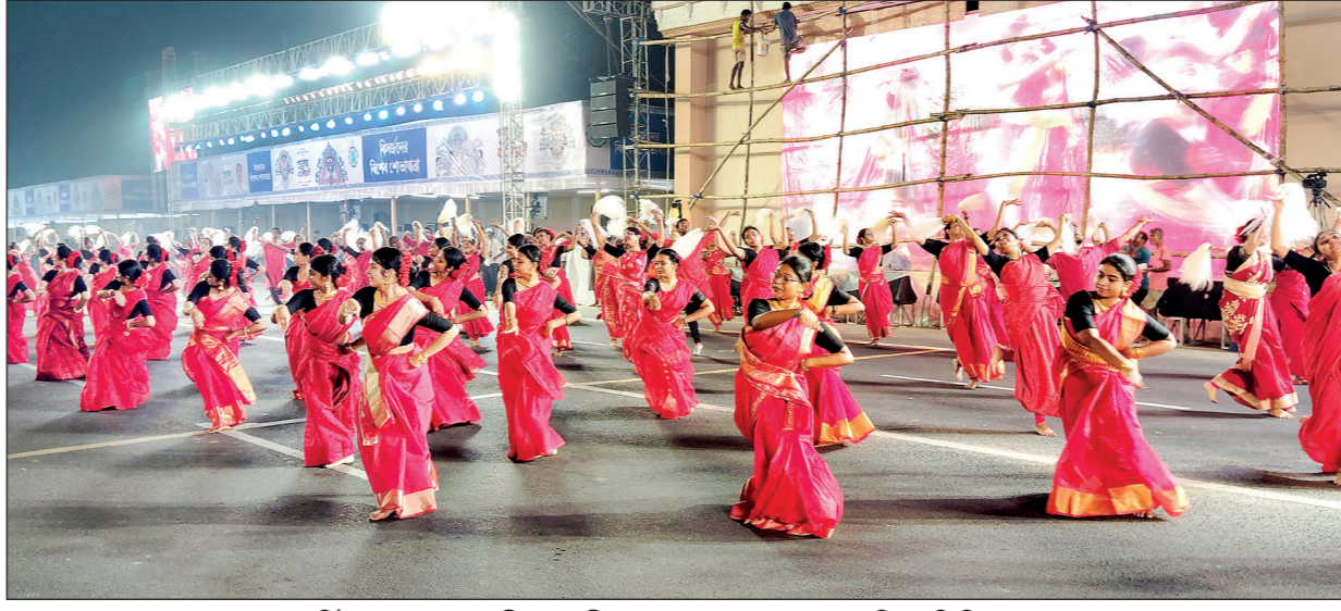
কার্নাটালের মহড়ায় 'দীক্ষামঞ্জরী'। রেড রোডে, সোমবার।