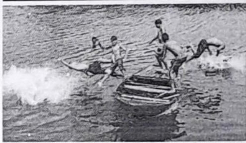
REFRESHING DIVE. Boys jump from a boat into the water for some respite from the scorching heat in Nadia, West Bengal, on Wednesday.