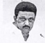
The Chief Minister MK Stalin

Tamil Nadu Legislative Assembly unanimously adopted a resolution urging the Centre to conduct a caste census.