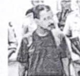
Delhi CM Arvind Kejriwal

The Central Bureau of Investigation (CBI) on Wednesday arrested Delhi Chief Minister Arvind Kejriwal a day after questioning him in Tihar jail in the caste policy case. The agency was given three-day custody of Kejriwal by session Judge Anoop Kumar on Wednesday in the caste case.