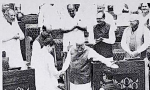
SECOND INNINGS. Prime Minister Narendra Modi and Leader of Opposition Rahul Gandhi exchange a handshake as they accompany newly elected Lok Sabha speaker Om Birla to the Chair, in New Delhi on Wednesday.

The IUP-led National Democratic Alliance (NDA) secured its first victory in the newly-elected Lok Sabha as speaker for a second term. The Congress party has stated that it is prepared to push for an election if the post of Deputy Speaker is not given to the Opposition.