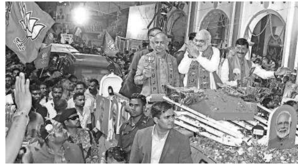
Shah at a roadshow in Ranchi on Friday.