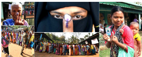
লোকসভা নিৰ্বাচনৰ দ্বিতীয় পৰ্যায়ত ভোটদানৰ বাবে শাৰী লগতে ভোটদান কৰাৰ পিছত ছিগ্ৰাইভিক্স আত্ম নিশ্চিন্ত ভোটদান, মৰিগাঁও তুৰুকাৰে