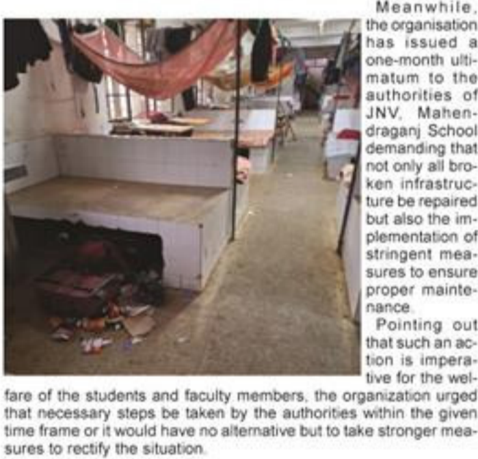
Meanwhile, the organisation has issued a one-month ultimatum to the authorities of JNV, Mahendraganj School demanding that not only all broken infrastructure be repaired but also the implementation of stringent measures to ensure proper maintenance. Pointing out that such an action is imperative for the welfare of the students and faculty members, the organization urged that necessary steps be taken by the authorities within the given time frame or it would have no alternative but to take stronger measures to rectify the situation.