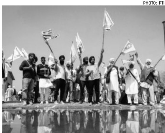
Farmers at a mahapanchayat in New Delhi on Thursday

Thousands of farmers gathered at Ramlila Maidan on Thursday and pledged to continue their protest until the Centre fulfils their pending demands, including a law on the minimum support price (MSP).