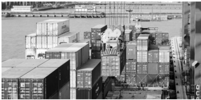
The commerce department is also working with the Department of Revenue and the Department of Post to expedite e-commerce exports