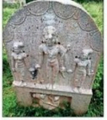
FAMILY TIES: Harun Basha, a researcher, discovered the stones that depict couples and their children