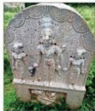
FAMILY TIES: Harun Basha, a researcher, discovered the stones that depict couples and their children