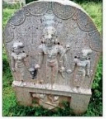
FAMILY TIES: Harun Basha, a researcher, discovered the stones that depict couples and their children