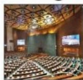
On May 18, the Lok Sabha Secretariat announced that Speaker Om Birla has met PM Modi and extended him an invitation to inaugurate the new building. This drew flak from opposition leaders, who argued that the head of the legislature should perform the inauguration, not head of the govt

Meanwhile, AAP said it is "upset" the Parliament building is not being inaugu-