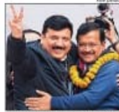
Delhi CM Arvind Kejriwal (R) and Aam Aadmi Party Rajya Sabha member Sanjay Singh

The court rejected the politician's main contention that GU is considered a State