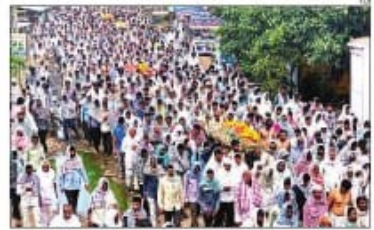
They were killed in a road accident in Rajasthan on Wednesday

Three were cremated at the Palwal Brahmin community facility and seven at