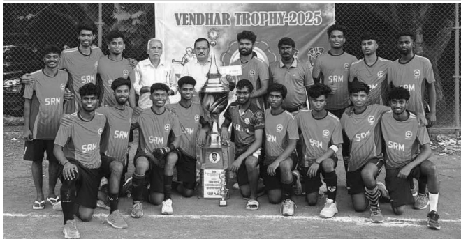
The SRM Institute of Science and Technology (SRM IST) men's hockey team emerged victorious at the South India-Level Inter-Collegiate Hockey (Men) Tournament - Vendhar Trophy 2025, organised by SRM Arts and Science College on September 4 and 5.