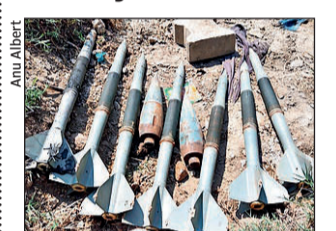
Police have sought Army's help for additional details and expertise

Patiala: The discovery Monday of seven rocket shells in a bag in a garbage heap near a school in Punjab's Patiala district is being investigated by police, reports Bharat Khanna.