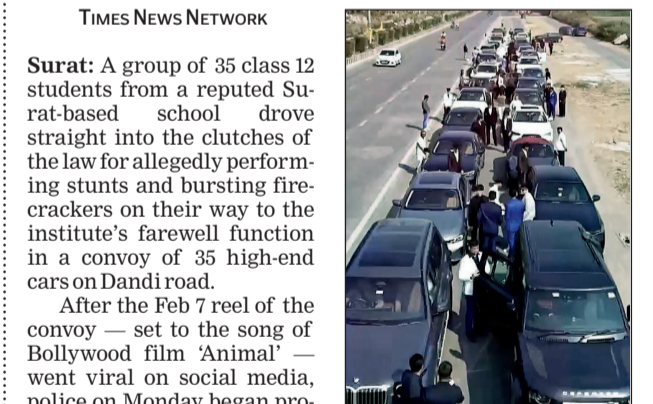
Cops have initiated action against the students and their parents and seized 12 cars that can be identified

Police initially claimed these were non-working rocket launchers. After investigations, police said the "unidentified objects" were probably dumped there by a scrap dealer. However, further investigation is being conducted to check the origin of these devices. Police have sought Army's help for additional details and expertise.