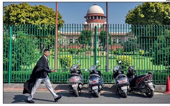
SC was told that though the court had in 2023 directed jurisdictional HCs to set up a bench to monitor the progress of trial in criminal cases against legislators, many states were yet to designate courts

Hansaria told the court that though SC had in 2023 directed the jurisdictional HCs to set up a bench to monitor the progress of trial in criminal