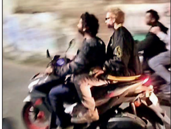
Ed Sheeran and Arijit Singh spent close to 5 hours together Monday