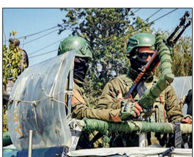
Security personnel stand guard in Imphal

Khemchand, who met Patra at a hotel in Imphal, told the media that the discussion was focused on restoring peace in the state. "The challenge we are facing is how to restore normalcy," Khemchand