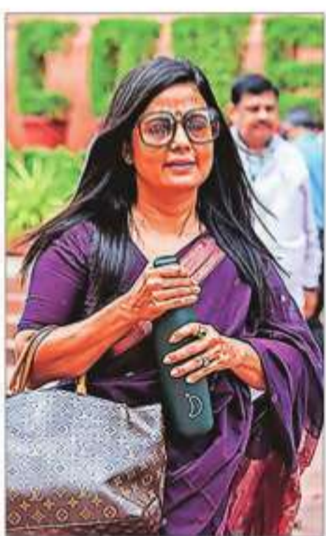
Mahua Moitra has been booked by the Delhi Police under Section 79 of the Bharatiya Nyay Sanhita

The TMC leader commented on a video posted on X (formerly Twitter) that showed Sharma arriving at the site of the stampede in Uttar Pradesh's Hathras. Moitra later deleted the post. The original post showed a man holding an umbrella and walking behind the National Commission for Women (NCW)