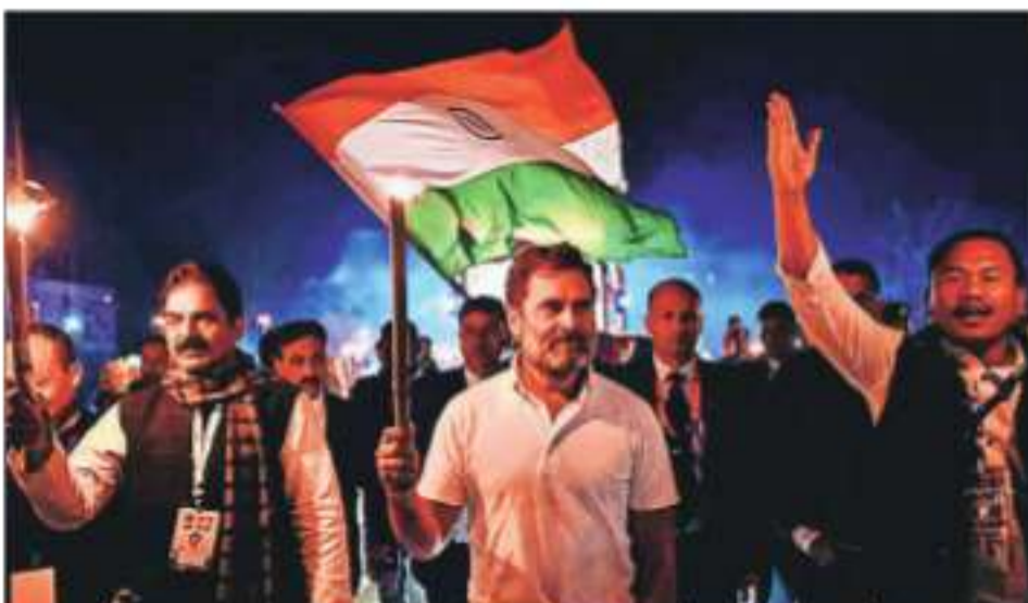
Congress leader Rahul Gandhi in Manipur in January this year. Gandhi's trip to the northeastern state on Monday will be his first as the Leader of Opposition in the Lok Sabha