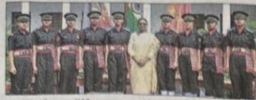
President Droupadi Murmu poses with nine women cadets during the Passing Out Parade at the IMA in Dehradun on Saturday.

HT Correspondent letters@hindustantimes.com DEHRADUN: President Droupadi Murmu on Saturday termed the passing out of nine women from the Indian Military Academy (IMA) in Dehradun to join the Army a milestone in the history of the country's defence forces and a watershed moment in the military academy's history.