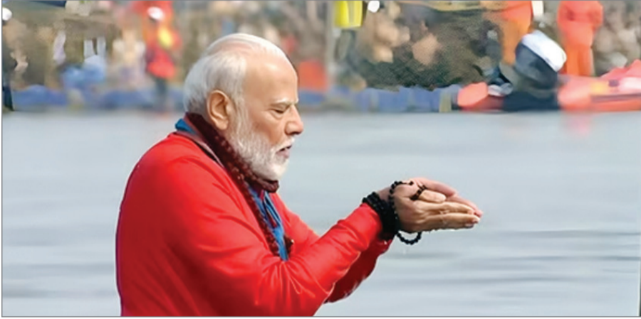
The Snan at the Sangam is a moment of divine connection, and like the crores of others who have taken part in it, I was also filled with a spirit of devotion," PM Modi said on X.

"Blessed to be at the MahaKumbh in Prayagraj.