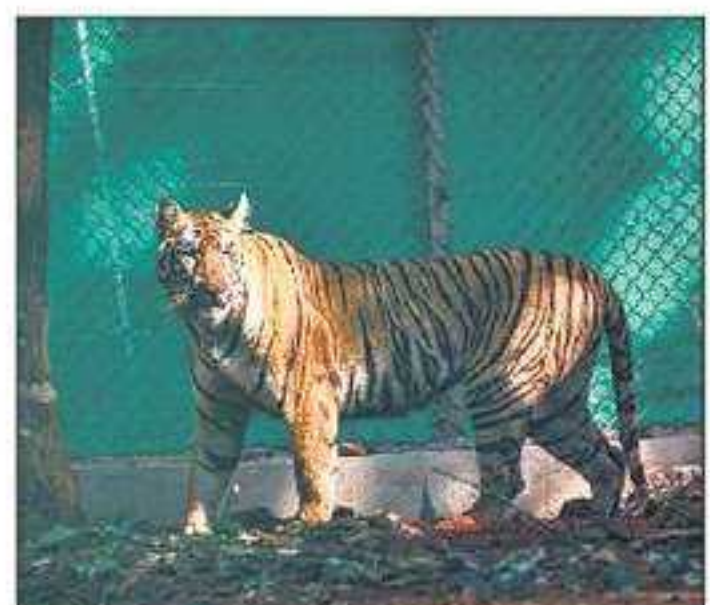
Zeenat entered West Bengal on December 20.

In April 2018, a tiger that had appeared in the Jangalmahal area — comprising Purulia, Ban-