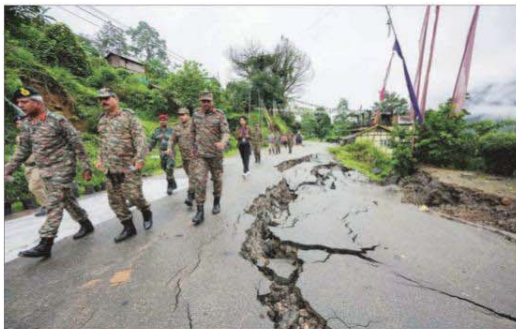
Indian Army officers inspect the damage caused by flash floods triggered by heavy rainfall in Naga village in north Sikkim on Saturday

The search operations for the missing 14 soldiers and remaining civilians are on way. So far, 2,563 people have been rescued from different areas and 6,875 people have taken