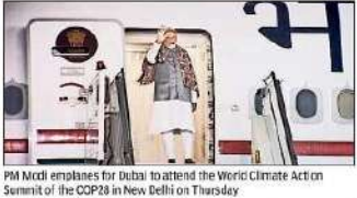
PM Modi speaks for Dubai to attend the World Climate Action Summit of the COP28 in New Delhi on Thursday