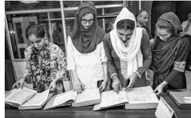
BEST FRIEND: Students at a 'Book Exhibition' in Jammu