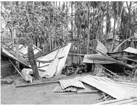
darmatha area in the Goalpara district on Saturday, added the report.

"Five cows died due to lightning in the Ban-