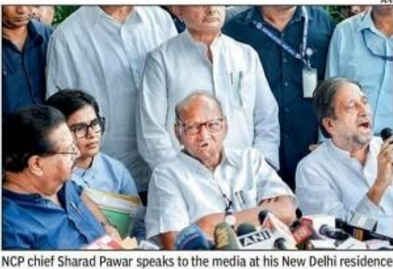
NCP chief Sharad Pawar speaks to the media at his New Delhi residence.

The meeting with Gandhi also took place at a time when