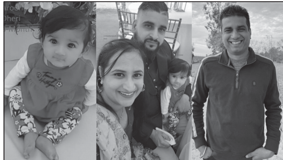
Ka dur jong ki nongshah rah bor ba la iasam na ophis jong u Sheriff.

Ki pulit ki la iathuh ba ki khlem pat ioh jingtip ne ban buddien ia katei ka longing haduh myn ta, lane ban ioh ia kano kano ka jingkyr pad kaba lah ban wan nangno nangno. Ki la bynrap ba ki detective ki la mih sha khmat ban pyrta na ka bynta ka jingai jingtip bad la pynher ia ka lieng suin ban pynlong ka jingwad na ka bynta katei ka longing. "Ngi dei ban pynpoi iing ia kane ka longing," ong u sheriff, da kaba buh jing kyrpad na ka bynta kano kano ka jingtip ha kaba iadei bad kane ka jingjia na ki paidbah.